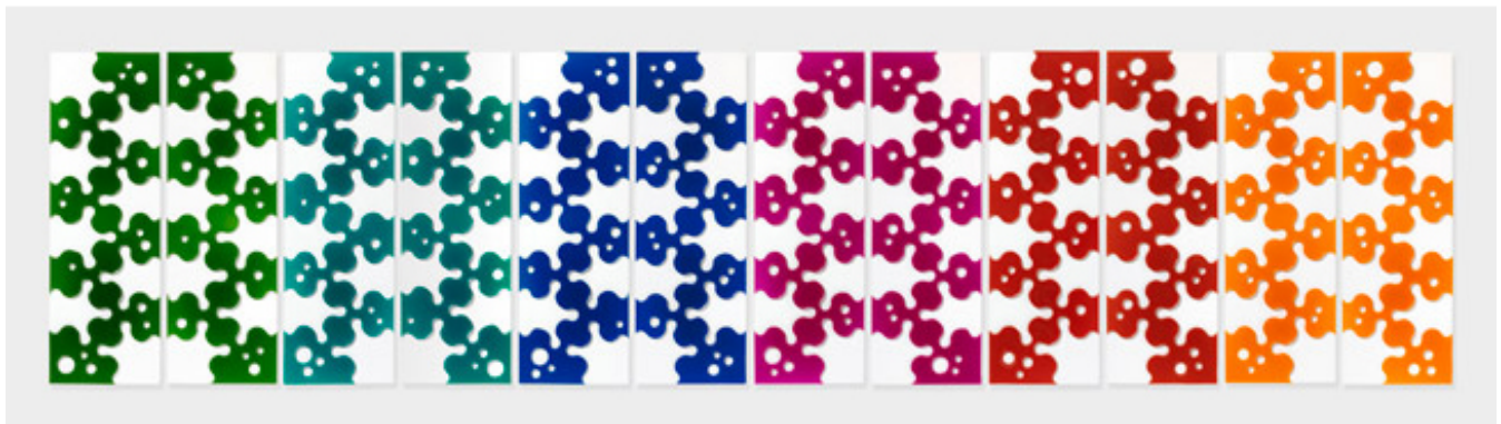
Infinite Vibration , 2016, Cast rubber on painted wood panel, 36 x 144 x 2 inches.

We are pleased to announce Positive Vibration , an exhibition of recent work by Niho Kozuru.